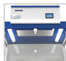
Explosion-proof Fluorescent Lamp