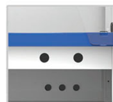
Water & Gas tap reserve mouth