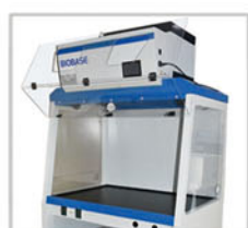
Front Window Front window reversal design