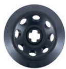
Angle rotor | GDF007 1.5/2 mL×8 4000 rpm/990 ×g 7000 rpm/2910 ×g 10000 rpm/5610 ×g