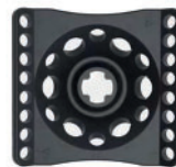
Angle rotor | GDF013 1.5 mL×6+0.5 mL×6+0.2 mL×8×2 4000 rpm/912 ×g 7000 rpm/2793 ×g 10000/5701 ×g